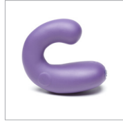
G-Kii Purple 5060170970577