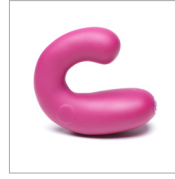
G-Kii Fuchsia 5060170970584