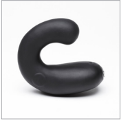
G-Kii Black 5060170970553