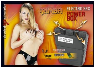
Rimba powerbox starter set # 850